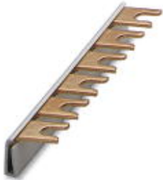
Wiring bridge for modules with connecting pitch 17.5 mm, 1-phase, 6-pos.

Please be informed that the data shown in this PDF Document is generated from our Online Catalog. Please find the complete data in the user's documentation. Our General Terms of Use for Downloads are valid ( http://download.phoenixcontact.com )