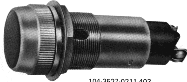
104-3527-0211-403 Flat lens